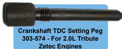
Crankshaft TDC Setting Peg 303-574 - For 2.0L Tribute Zetec Engines