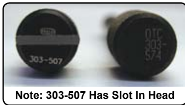
Note: 303-507 Has Slot In Head

The 2001–2004 2.0L Tribute Zetec engine is a keyless camshaft and crankshaft engine that uses a timing belt not a timing chain. The SST Crankshaft TDC Setting Pegs shown below (303-507 & 303-574) are not interchangeable. However, the LF, L3 and Zetec engines use the same Camshaft Alignment Timing Tool (303-465). The L3 w/TC engine uses Camshaft Alignment Timing Tool 303-1061.