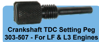
Crankshaft TDC Setting Peg 303-507 - For LF & L3 Engines